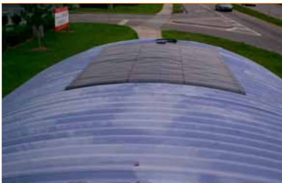
Optional thin film roof mounted solar panel