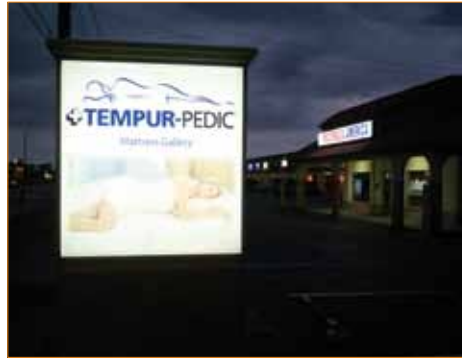
Interior Illuminated Signs