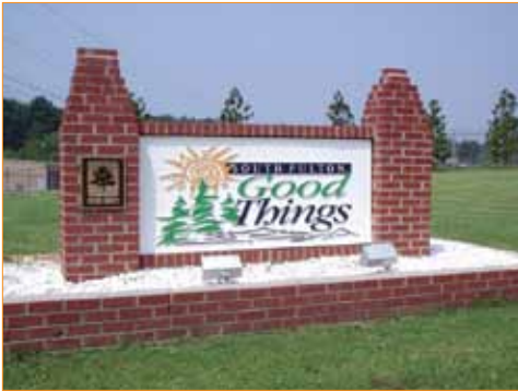
Community Welcome Signs

Designed for welcome/entry signs, monuments, billboards, interior and exterior illuminated signage. SOL's Outdoor Advertising Lighting Systems are the intelligent solar powered lighting solution for remote locations and utility connected approaches.